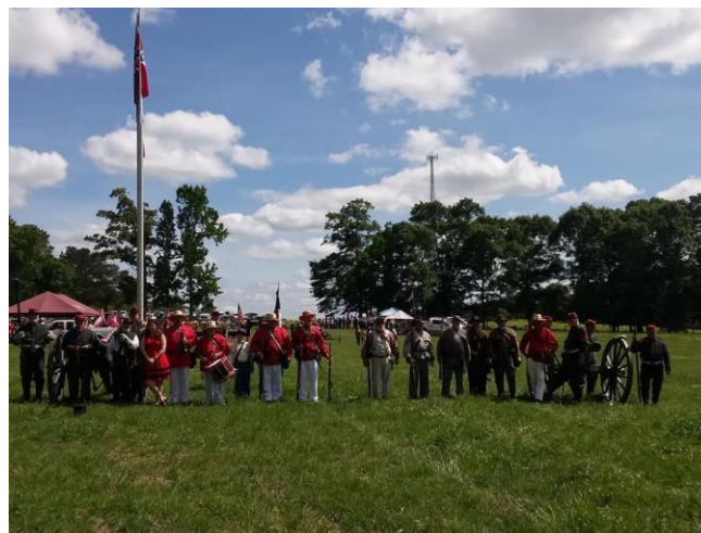
The 3 rd Miss. Inf. took a photo with Washington Artillery after the ceremony ended.