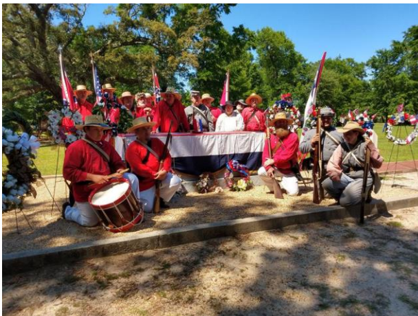
Camp Members took a photo with all participants around the Tomb of the Unknown Soldier.