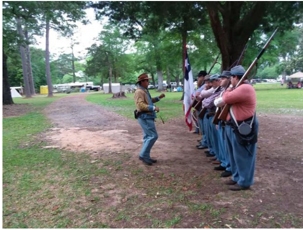
Camp Members drilled at the Citronelle Surrender Oaks Festival on Saturday May 4, 2019.