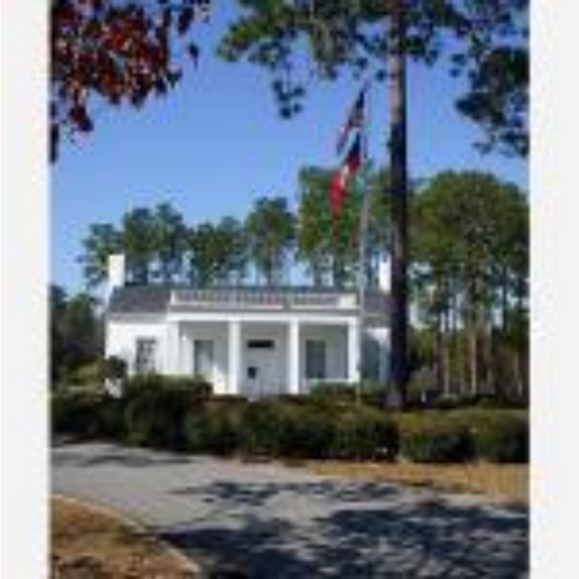
Jefferson Davis Memorial Historic Site