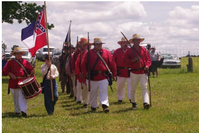
Camp Members participated in the I-55 Flag Dedication at Bogue Chitto, MS. on May 5, 2019.