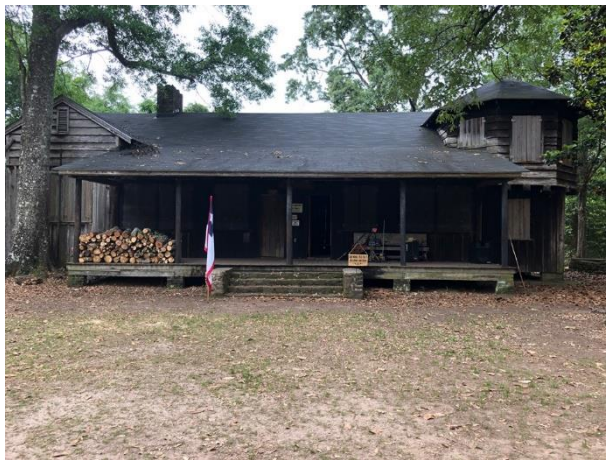
The Boy Scout Cabin at Camp Pushmataha in Citronelle, AL. is where the 3 rd Miss. Inf. bivouaced.