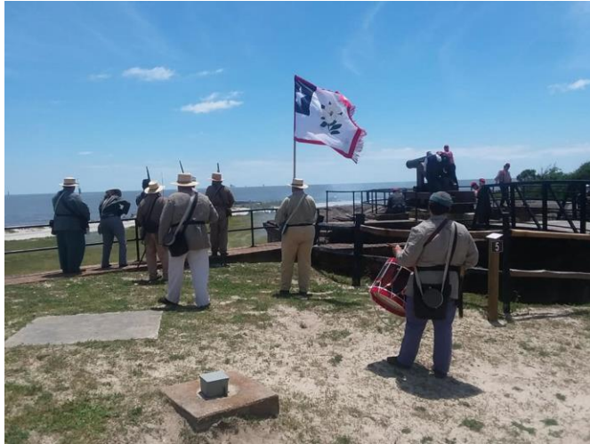
Camp Members fell in with the 3 rd Miss. Inf. at Fort Gaines on Sunday April 28, 2019.