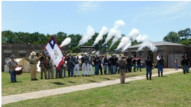
The Reenactors fired a volley for the crowd at Thunder on the Bay at Fort Gaines.