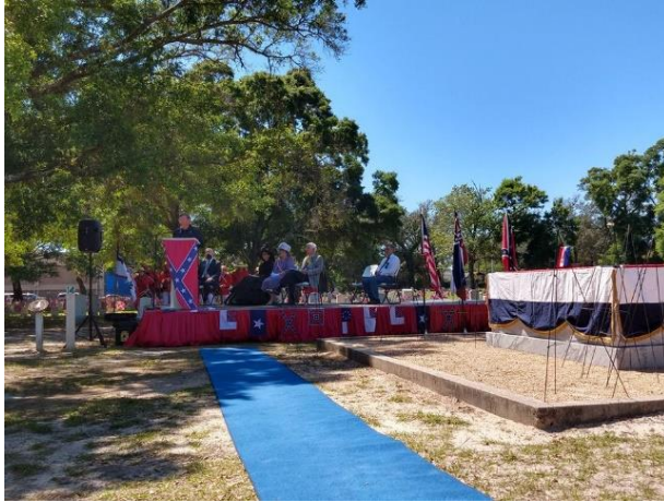
Camp #2263 members attended the Annual Confederate Memorial Day at Beauvoir April 27, 2019.