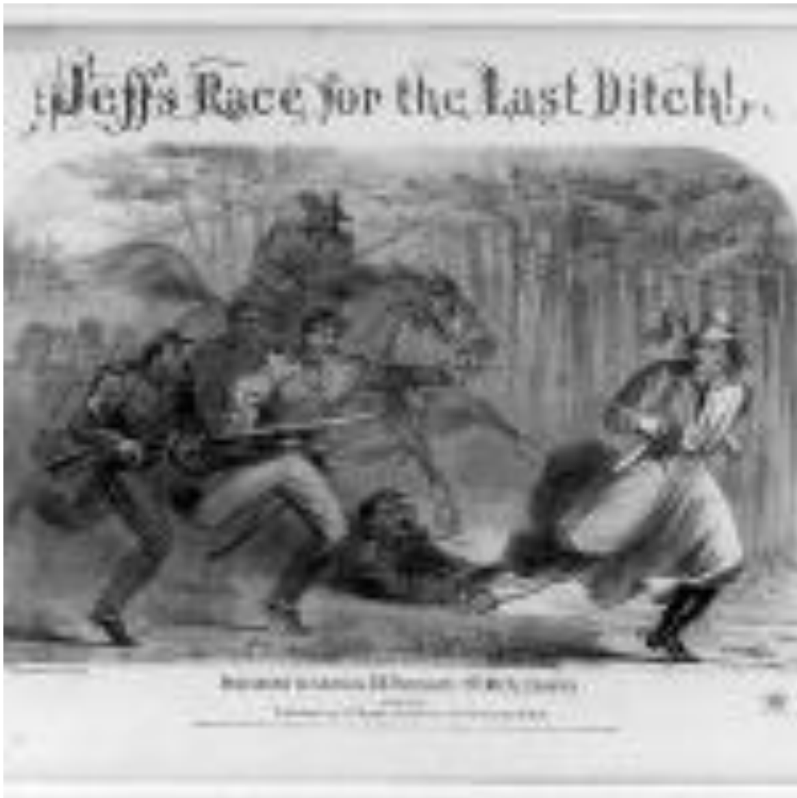
Capture of Jefferson Davis

A historic marker indicates the spot where he was arrested, and the surrounding area is now the Jefferson Davis Memorial Historic Site , a thirteen-acre park that features a museum, hiking trail, and picnic facilities. Jeff Davis County , in central Georgia, is named in the Confederate president's honor.