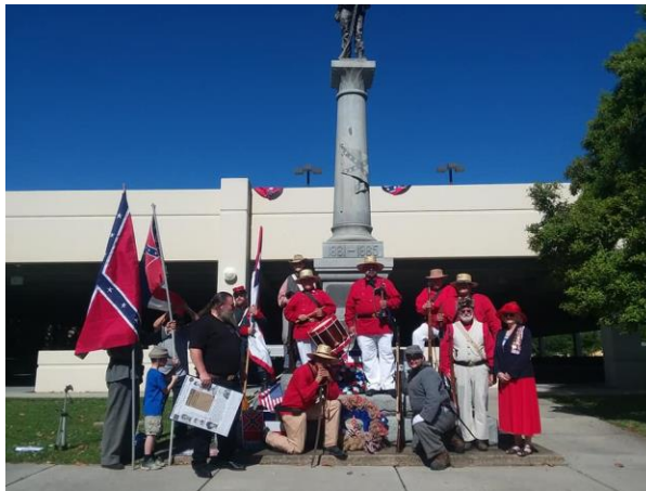
The participants all took a photo at the Memorial in downtown Gulfport on Saturday April 27, 2019.