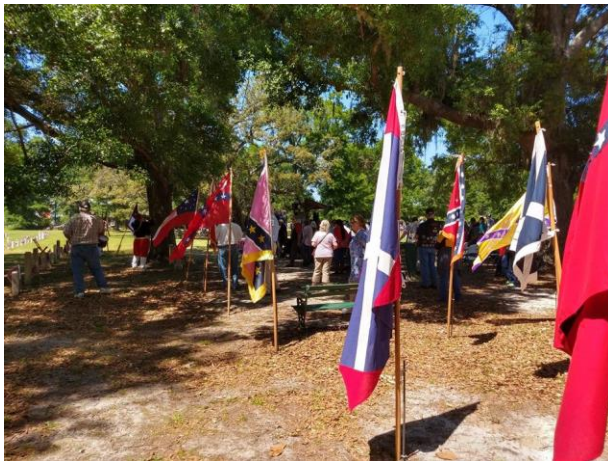
Camp #373 member Jim Huffman displayed his flag collection back at the Cemetery at Beauvoir.