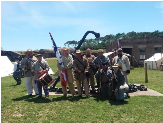
The 3 rd Mississippi Infantry took a photo inside the parade grounds at Historic Fort Gaines.